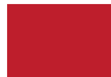
Carmine Red 3002