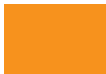
Yellow Orange 2000