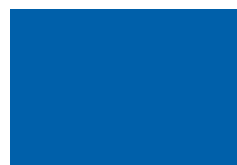
Signal Blue 5005